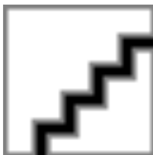
LEDlamps, A21 18W-100W 2700K 1600lm